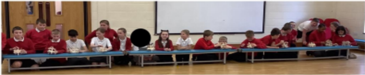
Year 6 making catapults