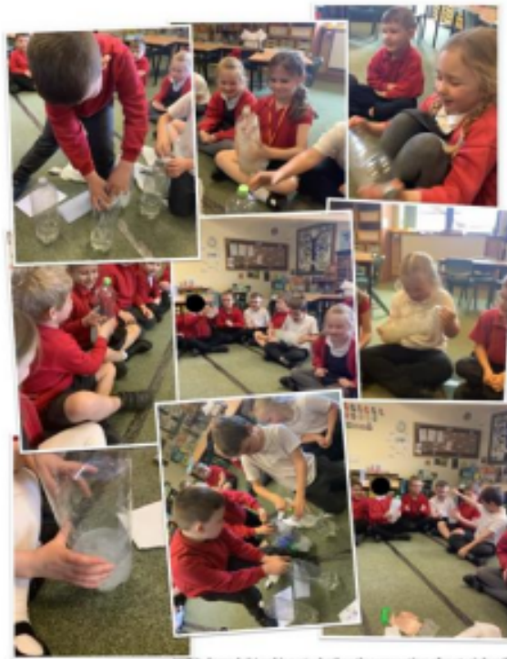
Will it degrade? Looking at whether the properties of materials will affect how easily it breaks down and degrades. We made our own 'toilets' and tried flushing different materials to find out what we can and can't put down them.