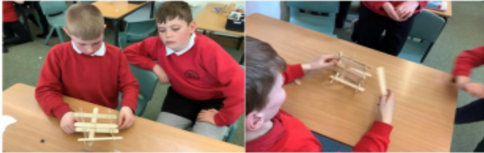
Year 6 Balloon cars