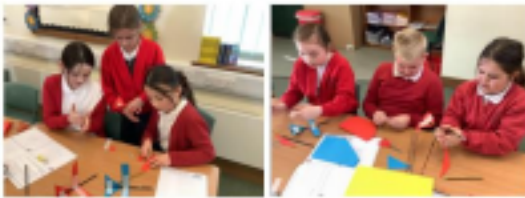
Y5 Testing gliders from Road to RIAT workshop

During the week 7th-16th March, we celebrated British Science Week at Brigg Primary. We had the opportunity to meet and interview lots of real life STEM engineers via live interviews. We met people who used Science every day in their jobs i.e, aviation engineers, NASA staff, doctors and even some who developed Lego and Minecraft games for a living! Year 5 were so lucky to have taken part in the Road to RIAT workshop where they were shown how to design and develop gliders with a particular focus on making them sustainable and eco friendly. (Fingers crossed we win some prizes in their competition!) We also had classes investigating the properties of materials and what degrades, children being wowed by the power of magnets and some classes competing to make the fastest balloon powered cars and the most powerful catapults.